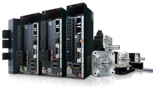
Image 1: The investment will strengthen Mitsubishi Electric's total industrial automation solutions offering by combining its own servo systems and other industrial automation products with Akribis' wide product line-up.